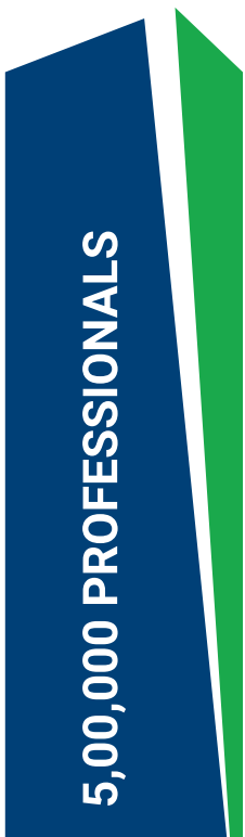
NUMBER OF BFSI PROFESSIONALS PRIVATE BANKS EXPECT TO HIRE IN 2025 - 28