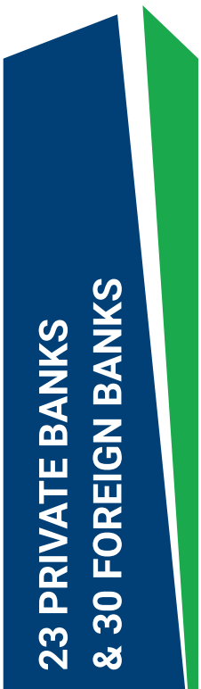
OFFER MULTIPLE EMPLOYMENT OPPORTUNITIES